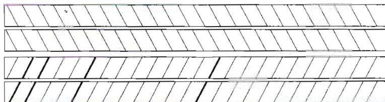
(2-7) Figure 2